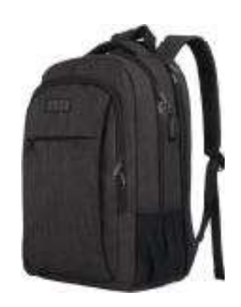
Backpack 36 ltr, hand luggage comp. $60,00