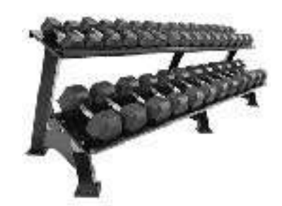
Hexa Dumbell Set

From 2,5 to 30 kg Price per piece on request.