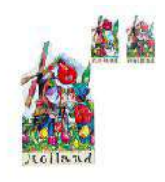
Multiple designs $8,00