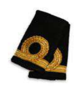
Epaulettes Every rank available. $45,00