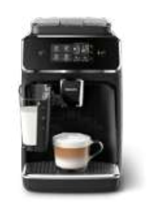
Philips Series 2200 Incl latte function $455 / €400