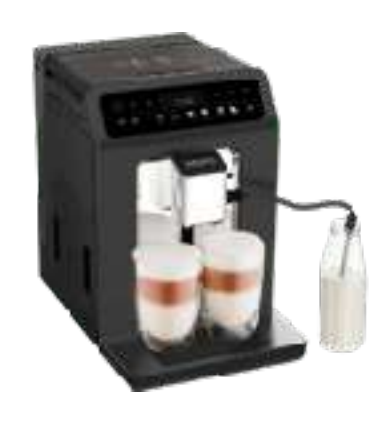
Krups Evidence One Incl latte function $690 / €610