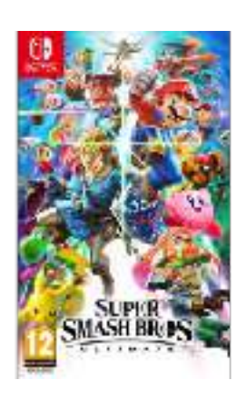
Super Smash Bros For Switch $70 / €60