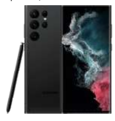
Samsung S23 Ultra 256 GB - several colours $1568 / €1400