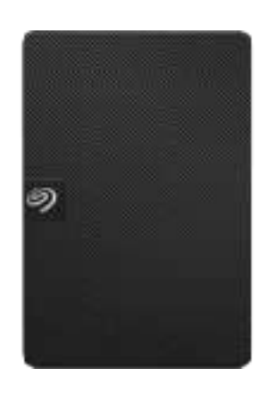
Seagate HDD Portable HDD 1 TB: $85 / €75