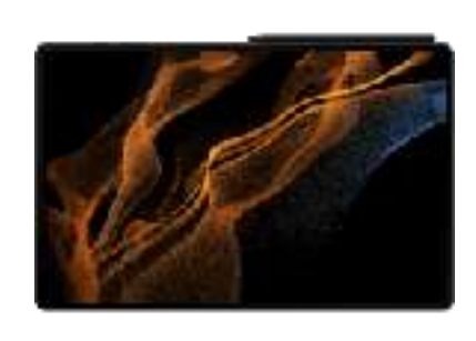
Samsung Tab S8 Ultra 11 inch - 128 GB $1245 / €1111