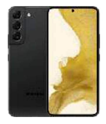
Samsung S23 128 GB - several colours $1065 / €950