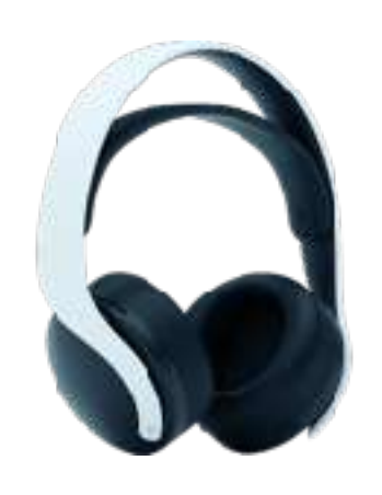
PS5 Headset Original from Sony $115 / €100