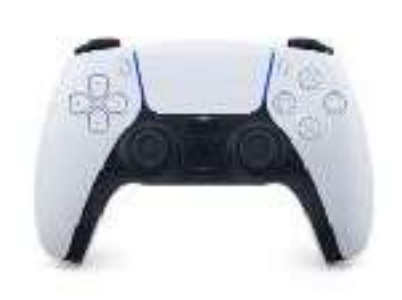
PS5 Controller Available in several colours $85 / €75