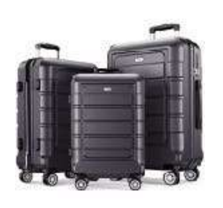
135 ltr for > 30 kg $170,00