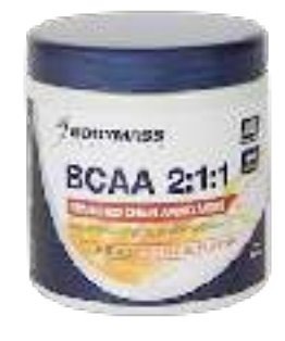
BCAA 300 gram per jar $35 / €30 per jar