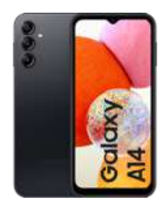
Samsung A14 6.6 inch - 64 GB $195 / €175