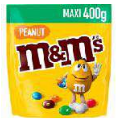
M & M's Original, peanut or crunch. $7,00