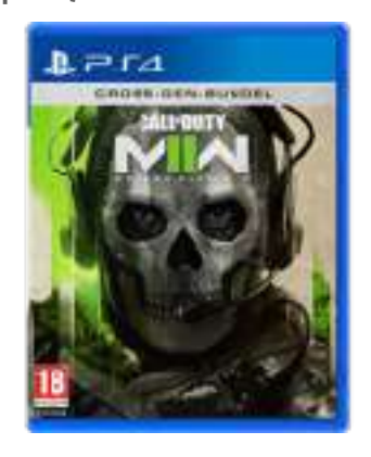
Call of Duty MWII