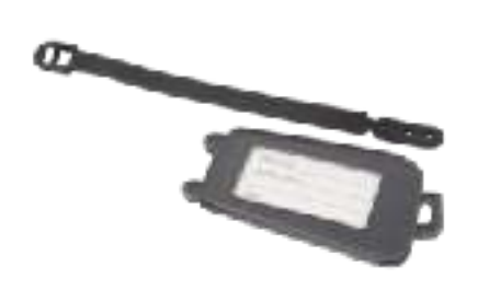
Luggage tag In black or pink $5,00