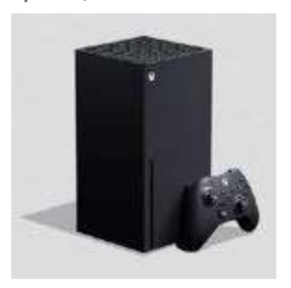
Xbox Series X Incl. 1 controller $585 / €510