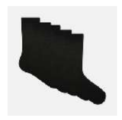
Socks 5 pair pack, black and white $10 / €9 per pack