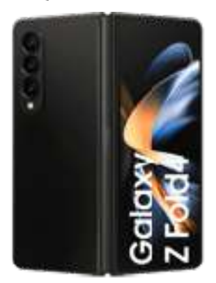
Samsung Z Fold 256 GB - several colours $1795 / €1600