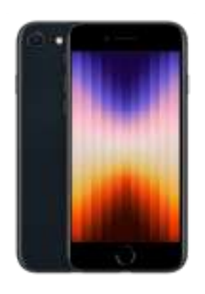
Apple iPhone SE 64 GB - several colours $625 / €555