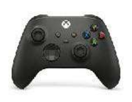
Xbox controller Available in several colours $85 / €75