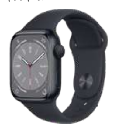
Apple Watch 8 41 mm - colours available $605 / €539