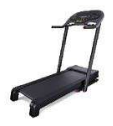
Treadmill Several versions in stock.