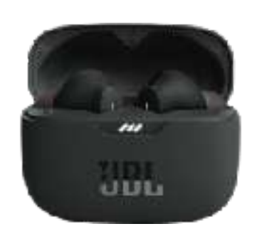
JBL Tune 230 NC