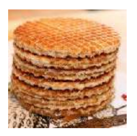
Stroopwafels 8 pcs per pack $6,00