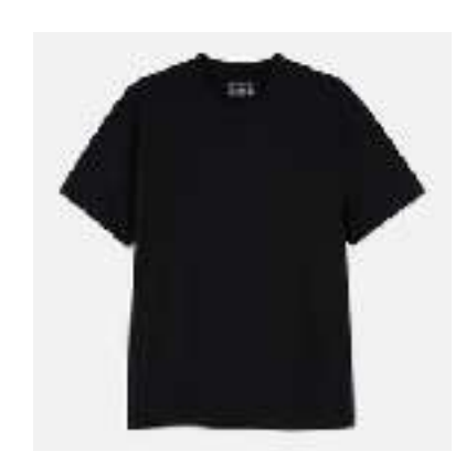
Shirts In black and white $10,00