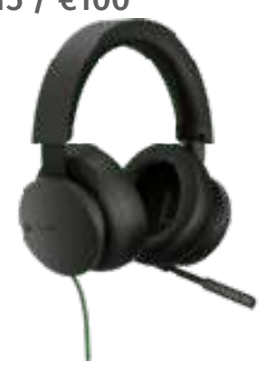
Xbox Headset Original from Microsoft $115 / €100