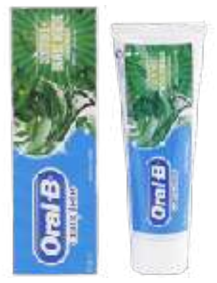
Toothpaste 75 ml per tube $6,00