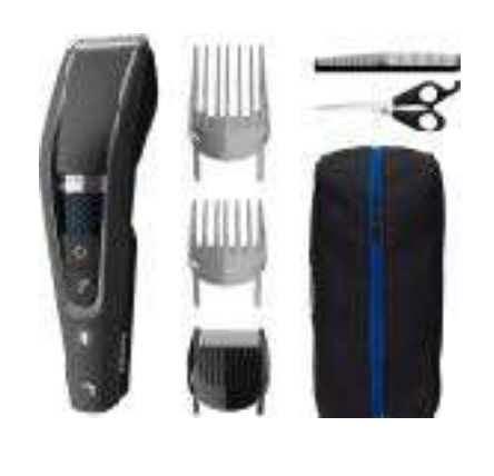
Complete set $89,00