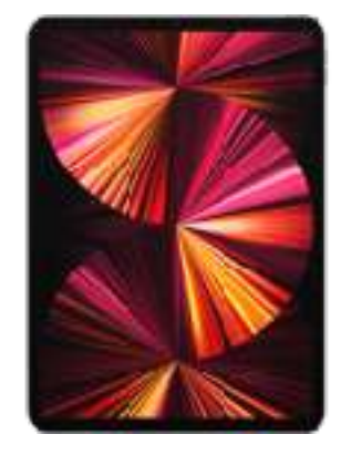
Apple iPad Pro 11 inch - 128 GB $1155 / €1030