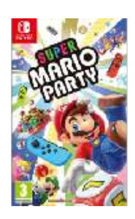
Mario Party For Switch $70 / €60