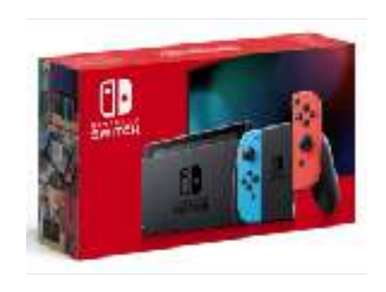
Nintendo Switch Incl. HDMI and docking $370,00