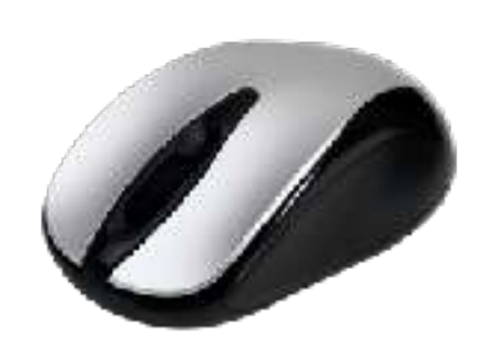
Wirless mouse HAMA wireless mouse $15 / €13