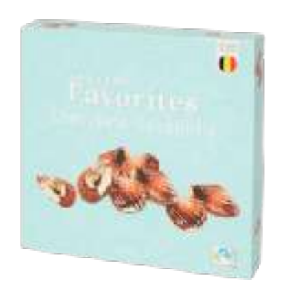
Belgian chocolates High quality chocolates $5,00 per box