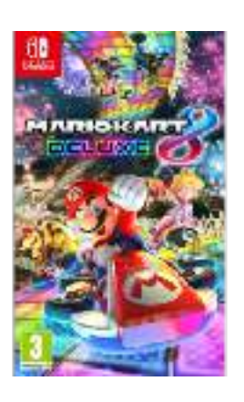
Mario kart For Switch $70 / €60