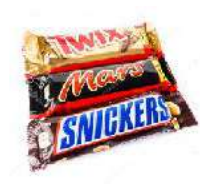
Mars/Twix/Snickers 10 pcs per reem $6,00