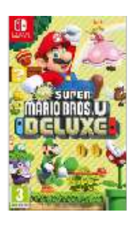
Mario Deluxe For Switch $70 / €60