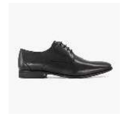
Uniform shoes Real leather, all sizes. $95,00