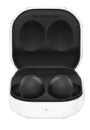
Samsung Earbuds 2 Samsung Galaxy Earbuds 2 $90 / €80