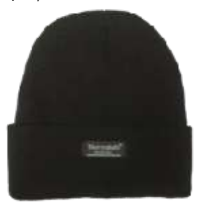
Winter hat One size fits all. $6,00