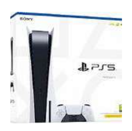
PS5 - Disc edition Incl. 1 controllers $635 / €549