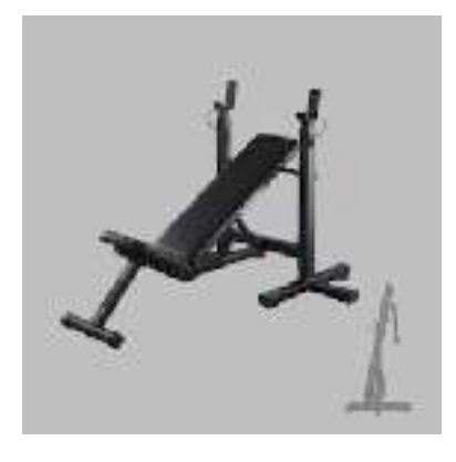
Fitness bench Several colours available.