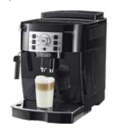
Delonghi Magnifica <u>ECAM 20.110.B</u> $390 / €345