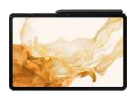
Samsung Tab S8 11 inch - 128 GB $865 / €749