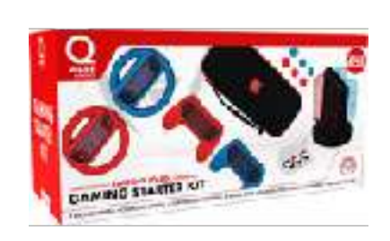
Switch starter All you need to start $95,00