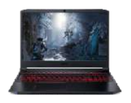
Acer Nitro 5 Gaming laptop $765 / €675