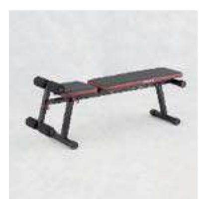
Ab training bench Foldable and strong.