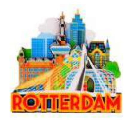
Fridge magnet - Rotterdam Multiple designs $6,00