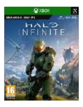
HALO Infinite For Xbox $70 / €60