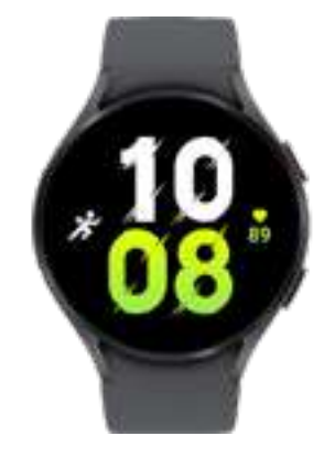
Samsung Watch 5 Samsung Galaxy Watch 5 $300 / €260