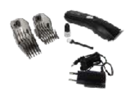
Hair Trimmer Complete set $35,00