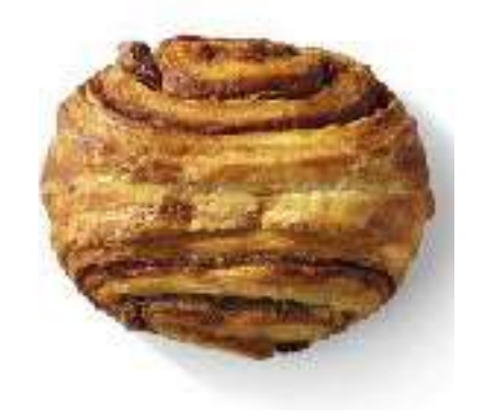
Incl latte function $1,50 per piece