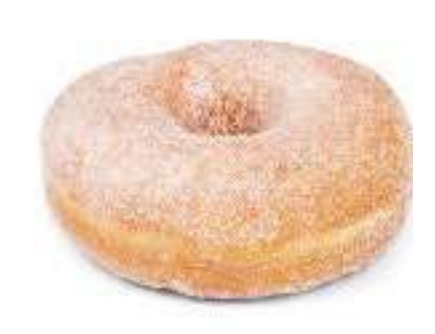
Fresh from bakery $1,50 per piece