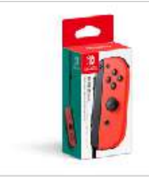
Switch controller Available in several colours $65,00