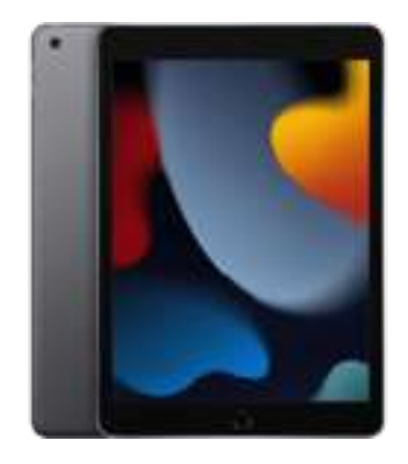
Apple iPad The classic - 64 GB $425 / €370