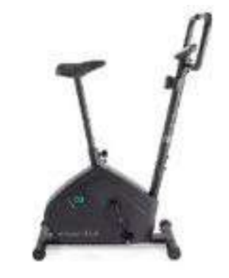
Home trainer Several versions in stock.