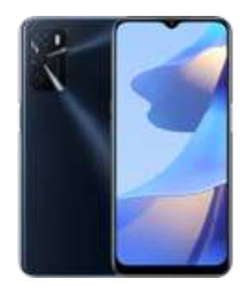
Xiaomi Redmi A1 6.52 inch - 32 GB $165 / €145