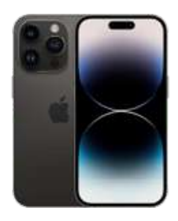
Apple iPhone 14 Pro 128 GB - several colours $1345 / €1200