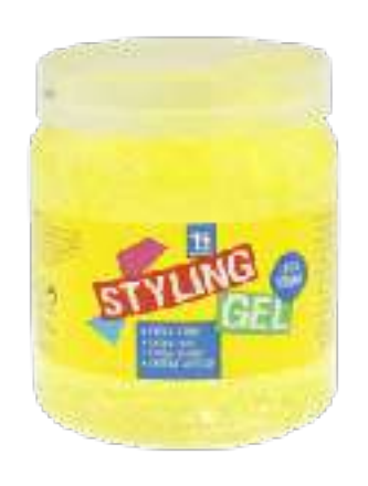
Hair gel 500 ml per jar $5,00