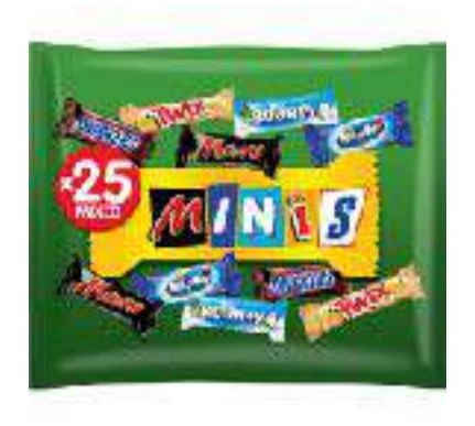
Mars mini's Mix of all the favourites $8,00