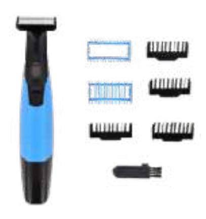
Body & Face Trimmer Rechargeable trimmer. $22,00