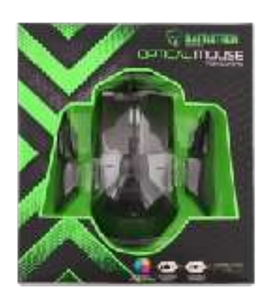
For gaming pc / laptop $20.00