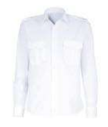
Uniform shirt Available in size 37 - 48 $65,00