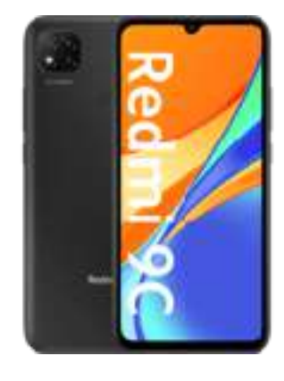
Motorola E32S <u>6.53 inch</u> - 32 GB $180 / €160