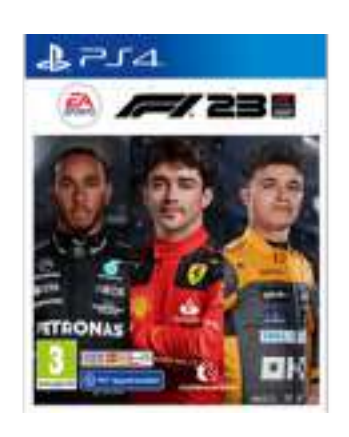
F1 23 For PS / Xbox $70 / €60