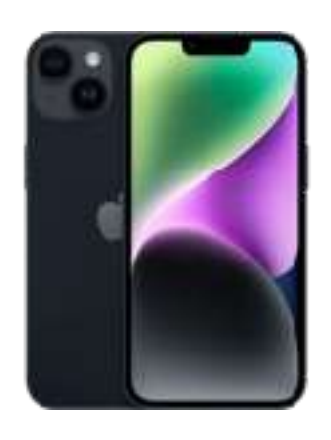
Apple iPhone 14 128 GB - several colours $1045 / €929