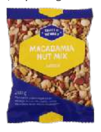
Macadamia mix 200 grams