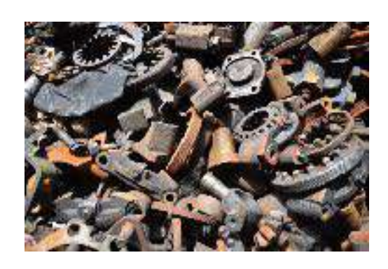
Scrap Up to $0,16 per kg

Email us on: rotterdam@crew-welfare-center.com Or